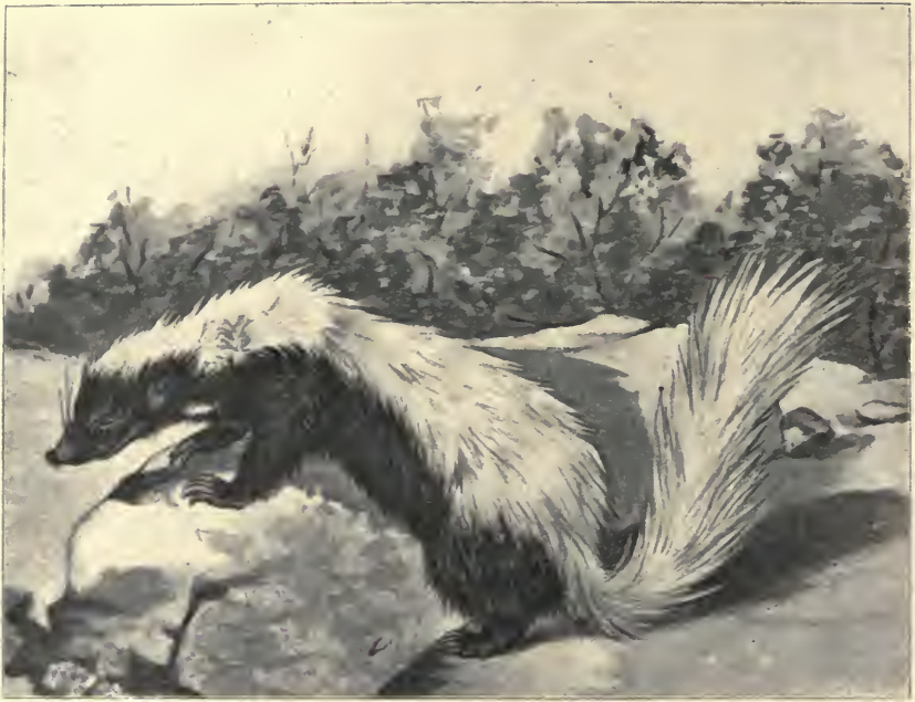
FIG. LVI. CONEPATUS M. MEARNSI . MEARN'S SKUNK.